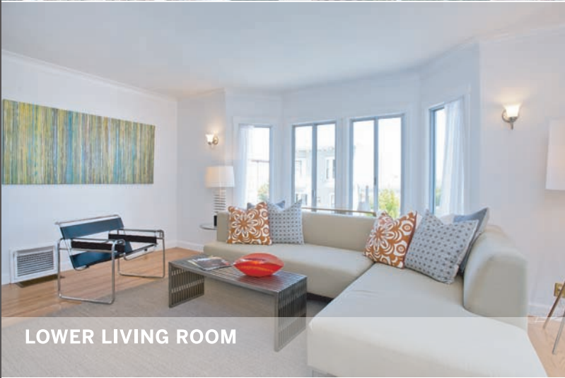
LOWER LIVING ROOM