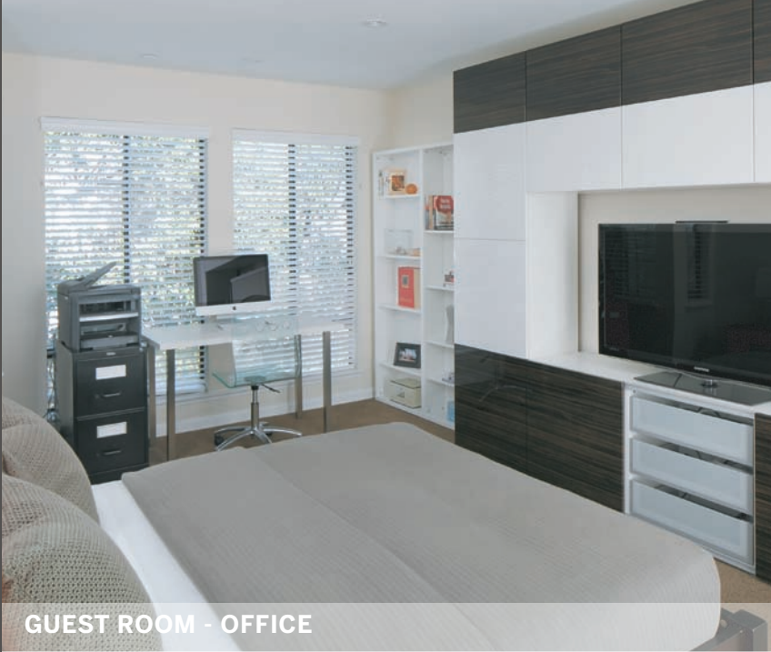
GUEST ROOM - OFFICE